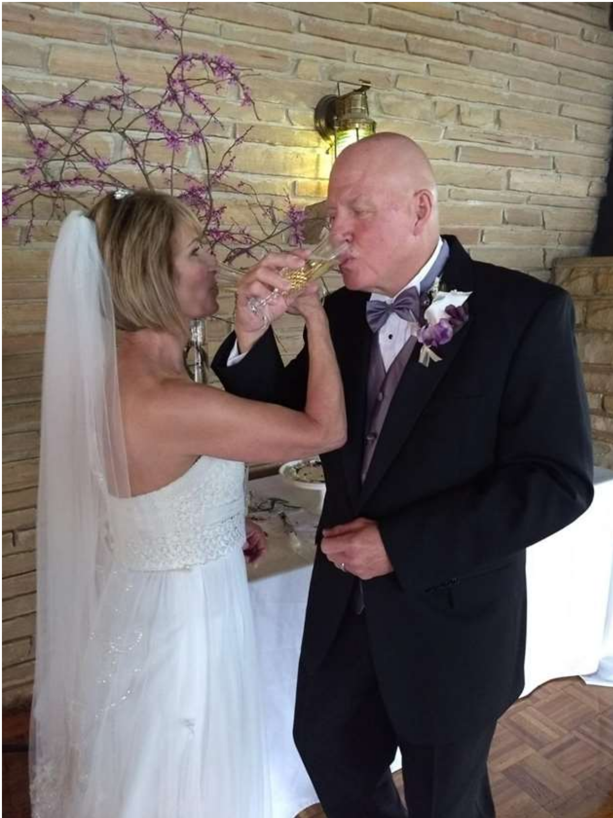
Toasting to a full life of running together