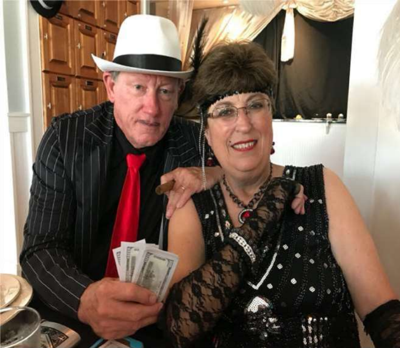
(Hmm..... $100 bills and he's the LGCY treasurer)

Prior to dinner, there were areas where everyone was able to get a portrait taken: