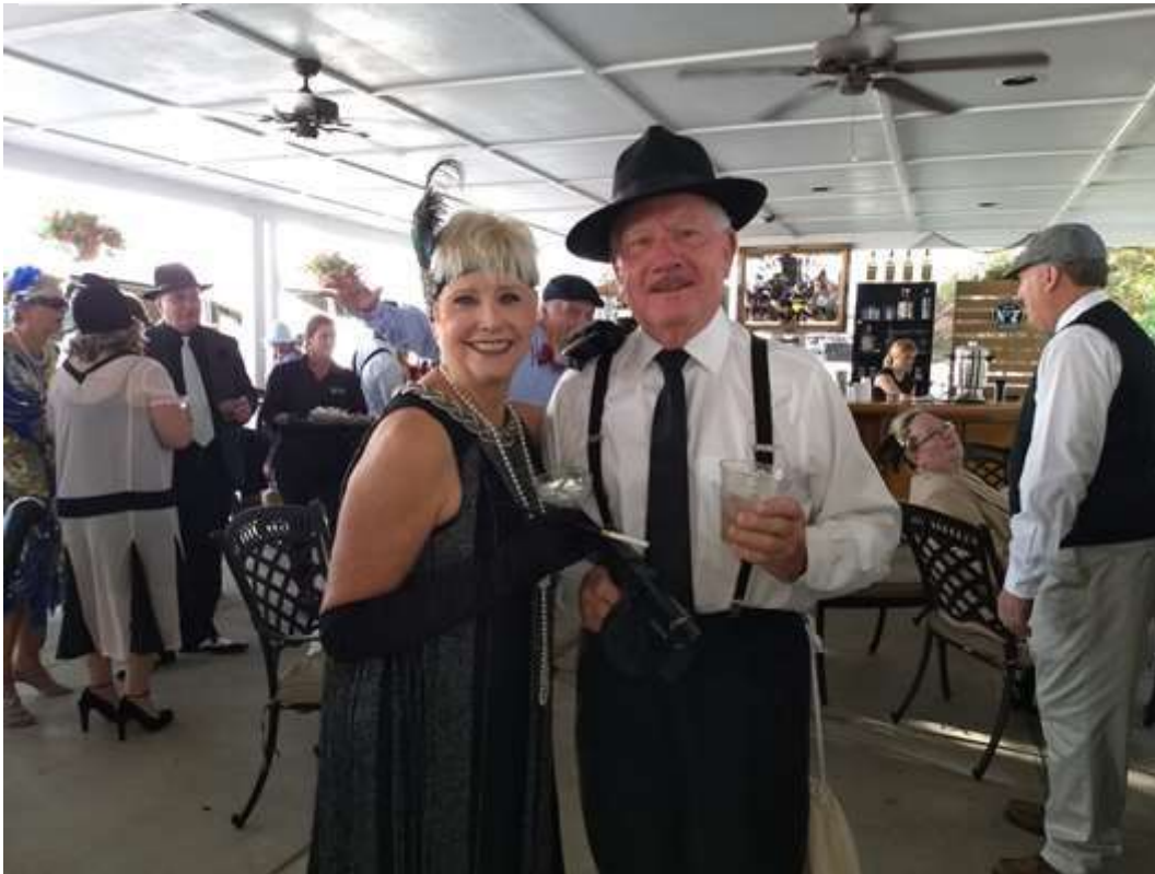
LGYC's Roaring 20's Ladies: